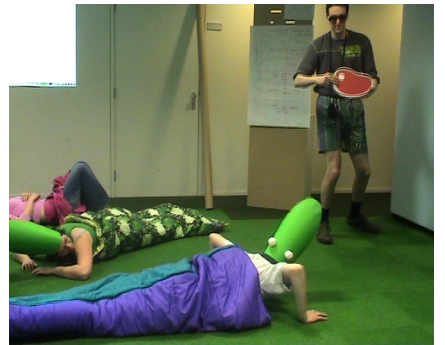
(a) Implementing the Pet interface on a (b) Feeding a Croc only if it is a Pet Dog